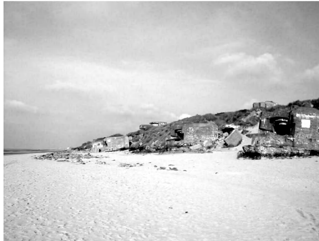
Fig. 2. German bunkers on the upper beach, Leffrinckoucke.

of the Dune Marchand (Fig. 1) while in the western part of the dune Dewulf the mean retreat rate was less than 1\text{m.yr}^{-1} . Along the Dune du Perroquet close to the Belgian border, stability prevailed (Clabaut et al. , 2000). In these fairly stable sectors, the foredune was progressively rebuilt and stabilized by vegetation. In the 1980s, the foredune was affected by breaches and blowouts, mainly due to human disturbance, and by erosional scarping during storms. Erosion was related to storm intensity and frequency. Analysis of storm at Dunkirk from 1962 to 1995 revealed an increase in intensity and duration from 1971 to 1977 (Clabaut et al. 2000; Vasseur and Héquette, 2000). Over the last few decades shoreline retreat was counterbalanced by sand accumulation at the top of the dune crest and on the backslope, resulting in a widening of the foredune. The refilling of dune blowouts and the development of a vegetation cover suggest a relatively balanced sand budget (Clabaut et al. , 2000).