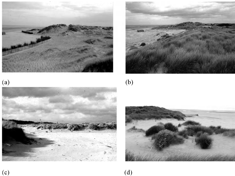
Fig. 4. Recent evolution of a 'managed' and a 'natural' sector at the Belgian border between 1998 and 2003: (a) erection of wooden fences on poorly vegetated chaotic dunes; (b) development of an 'artificial foredune'; (c) morphology of the breach in 1998; (d) natural formation of incipient foredunes.

foredunes, up to 2m, high have recently developed on the upper beach (Fig. 4d). Such an evolution shows that along a coastal sector with a positive sediment budget, deployment of dune rehabilitation structures is not always necessary.