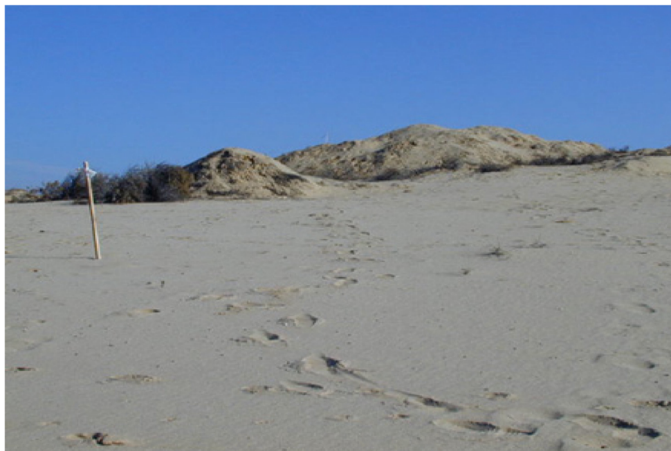
Fig. 3. The exposed nebkhas on the crest of the parabolic dune.