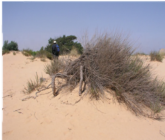
Fig. 2. The eroded windward side of a nebkha that exposes the roots of Artemisia monosperma .