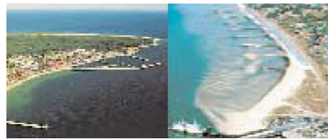
Baltic Sea site. North Sea site.

The common way of assessing the importance of biodiversity for the functioning of the ecosystem is to focus on functional groups (Raffaelli et al. 2001, Bolam et al. 2002). In the Baltic area, Bonsdorff & Blomqvist (1993) and Bonsdorff & Pearson (1999) presented exhaustive summaries of species functions, advocating the functional approach in biodiversity assessment, but did not answer how to quantitatively measure the biotic interactions necessary to address functionality.