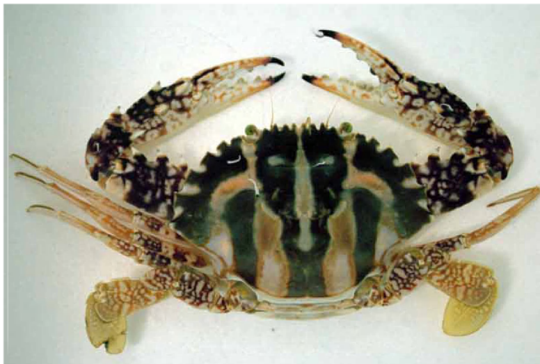
Figure 1. Charybdis feriata (Linnaeus, 1758). Collected near Barcelona, western Mediterranean Sea. Adult female (Carapace width: 125.0 mm; Carapace length: 81.3 mm) (ICMD 16/2005).

Size: One adult female CW 125.0 mm, CL 81.3 mm, SCL 79.7 mm; cheliped handedness: right-handed, RCL 95.1 mm, RCH 32.3 mm; AW 59.9 mm; fresh weight: 285 g.