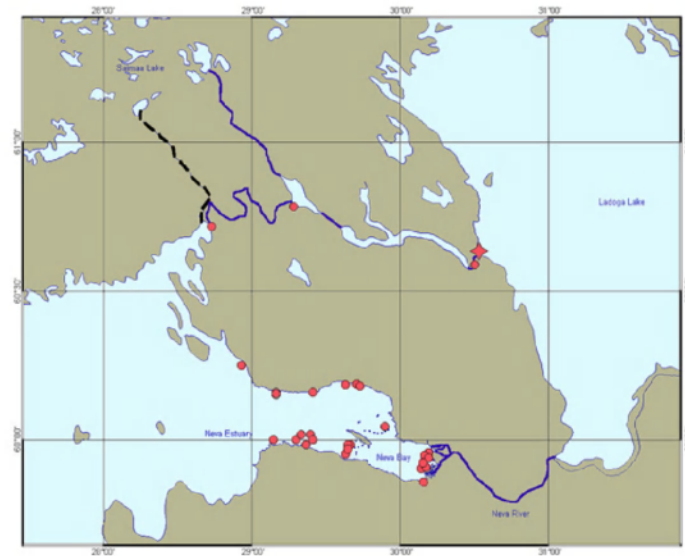
Figure 1. Location of Chinese mitten crab records in the eastern Gulf of Finland area. Asterisk indicate location of the first confirmed record in Lake Ladoga. Dashed line indicated the Saimaa Canal.

Bay (Figure 1), 60°37.9' N, 30°32.2' E. The crab measured: carapace width 57 mm, carapace length 53 mm, and body weight 81 g (Figure 2).