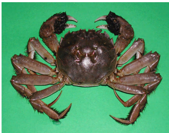
Figure 2. Adult male of Eriocheir sinensis caught in Lake Ladoga on 25 October 2005 (Zoological Institute RAS Collection Number 5/88481).

Most likely, this migrating individual entered Lake Ladoga from the Burnaya River, a lower part of the Vuoksa River, and was trapped in the gillnet while moving towards the Neva River and eastern Gulf of Finland as part of regular seasonal migration of adult crabs to the western Baltic or North Sea for reproduction. In 1997 one individual of E. sinensis was found in the lower Burnaya River, close to the location of the first record of this species in the Lake Ladoga (Figure 1).