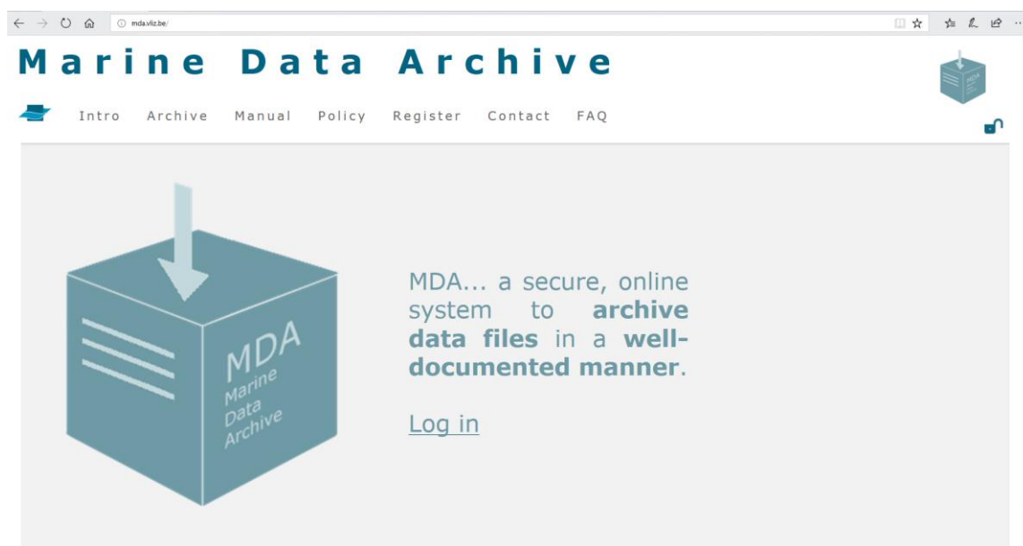
Screen capture of the MDA used as ASSEMBLE Plus repository

In order to ensure access to data in the long term, the Marine Data Archive (MDA), hosted at VLIZ at http://mda.vliz.be , has been selected as a central repository for ASSEMBLE Plus-generated data. This data repository is freely accessible to individuals, consortia, working groups and institutes upon registration. In addition to archiving the data generated as part of ASSEMBLE Plus, it enables third parties to find and access the data.