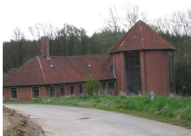
The Brorfelde Observatory and Conference Facilities