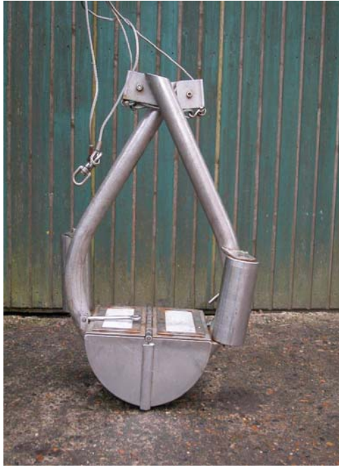
Figure 3. Van Veen grab of the Senckenberg Institute, Germany