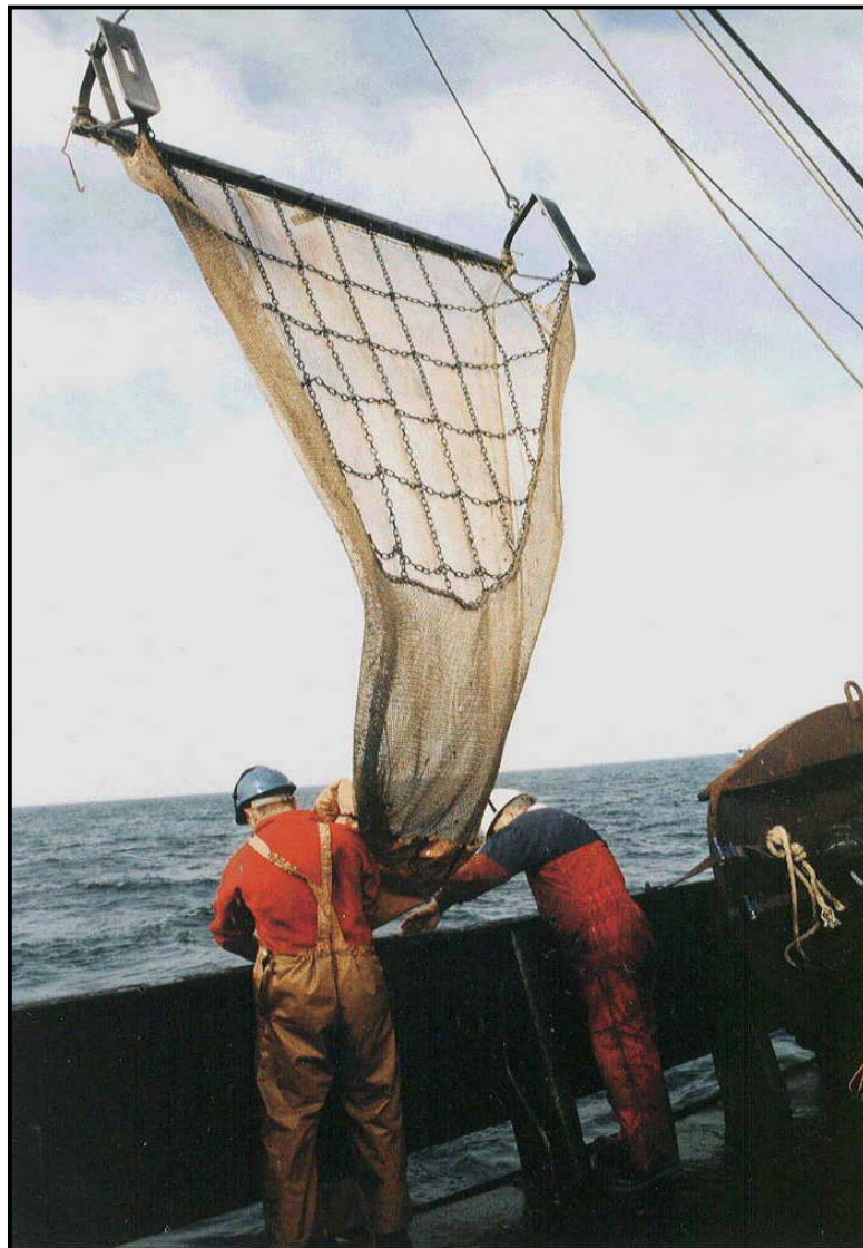
Figure 2. 2m beamtrawl.