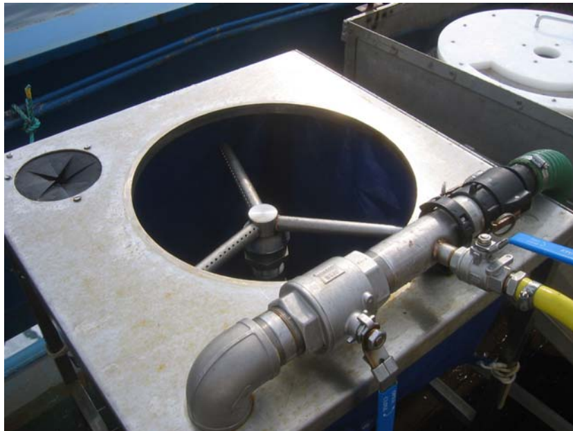
Figure 5. Gardline Autosiever