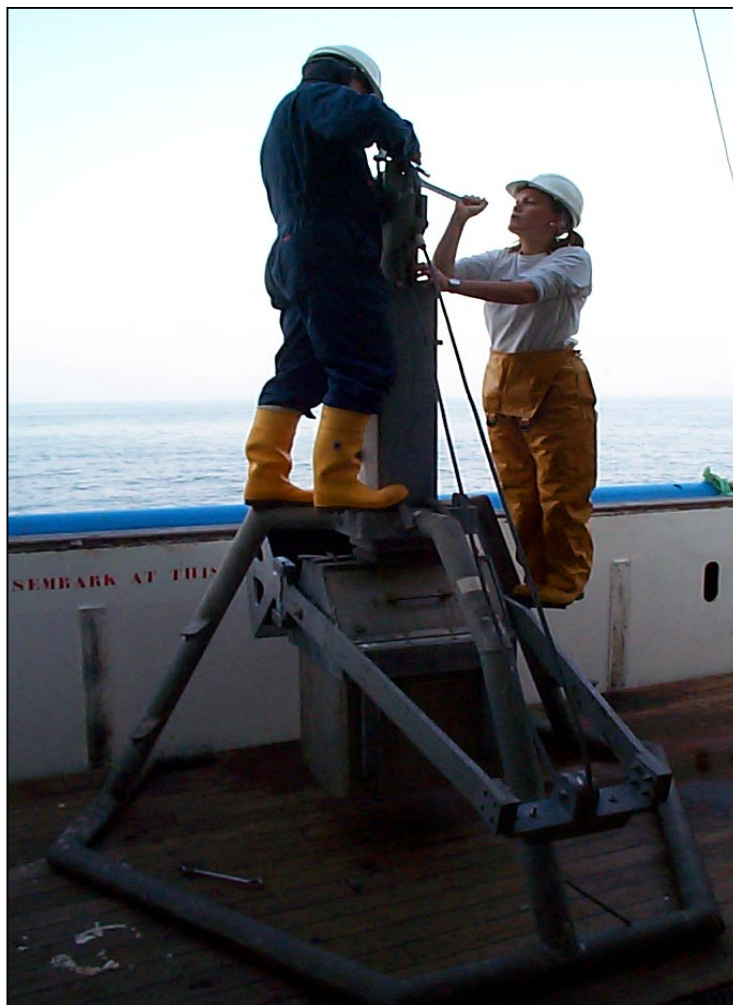
Figure 4. Box corer of FRS Marine Laboratory