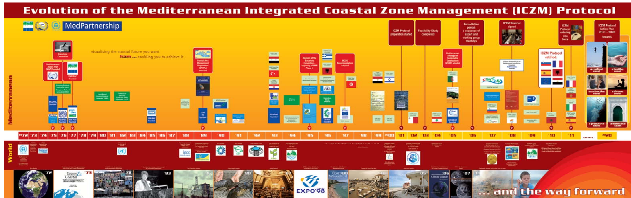
Appendix 3: Poster presented at PEGASO Project Meeting in Romania, July 2011 – zoom in for details